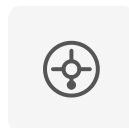
Type E Plug